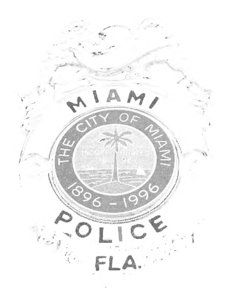
PERSONNEL RESOURCE MANAGEMENT SECTION STANDARD OPERATING PROCEDURES RECRUITMENT AND SELECTION UNIT